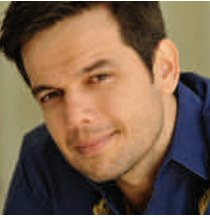
OTAVIANO COSTA Actor

Otaviano Costa is an actor, singer, and television presenter. He began his career as a radio announcer; hosted live shows in the country's leading television stations, as well as MTV; and starred in six soap operas.