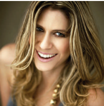
DIDI WAGNER Model and television presenter

He currently presents the "Video Show" variety show, on Brazil's largest free channel, TV Globo.